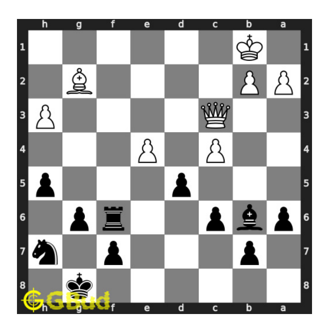
Figure 6: Bxb6 - Bishop captures the hanging rook. This is how you gain a rook by a skewer attack