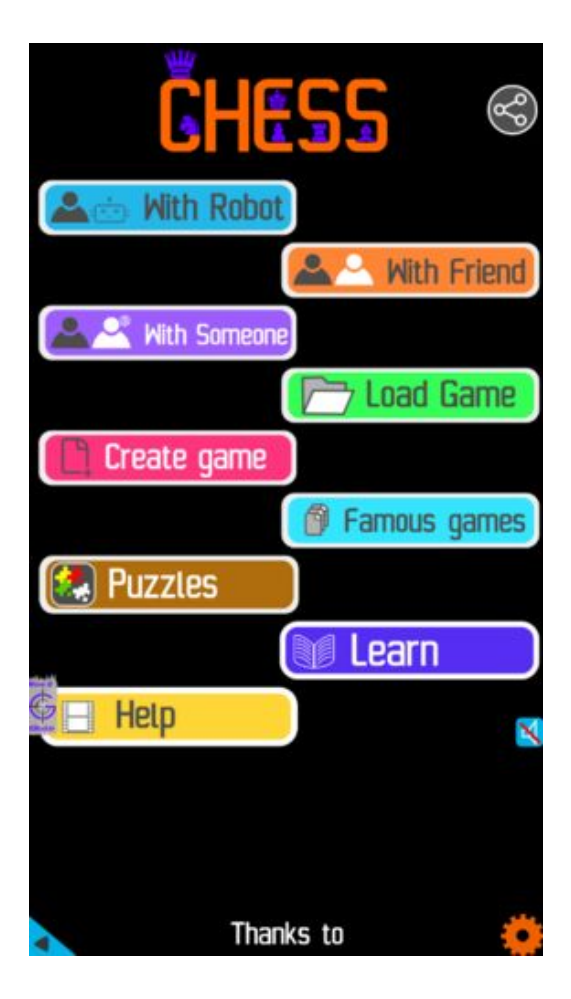
Figure 11: Play chess online for free. Solve puzzles and play with friends

Play chess for free at https://gbud.in/chs