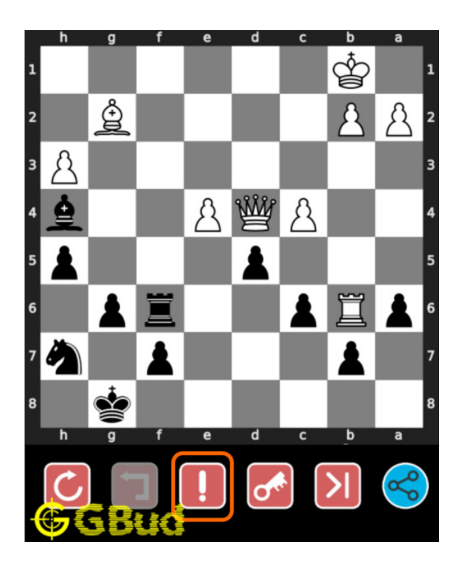
Figure 8: Click the help button to get help on next move @ https://gbud.in/gzknkl2